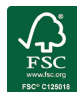
The mark of responsible forestry